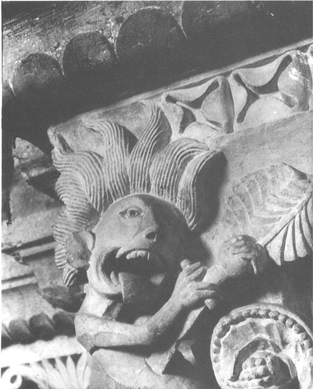
FIGURE 2: Anger Commits Suicide (twelfth century). One tradition, largely associated with medieval monasteries, equated emotions with vices and depicted them as utterly out of control. Such ideas fed into the hydraulic model of emotions. In this Romanesque sculpture from Sainte-Madeleine at Vézelay, anger is personified as a flaming-haired demon, mouth open wide, tongue hanging out, and so frenzied that she (anger, ira in Latin, is gendered female) commits suicide.

also accords with theories of energy that were up-to-date when Darwin and Freud were writing. Charles Darwin, like other scientists of his day, postulated a “nerve-force” that was liberated “in intense sensations,” among them emotions. Freud talked of impulses that could be deflected, repressed, or sublimated but,