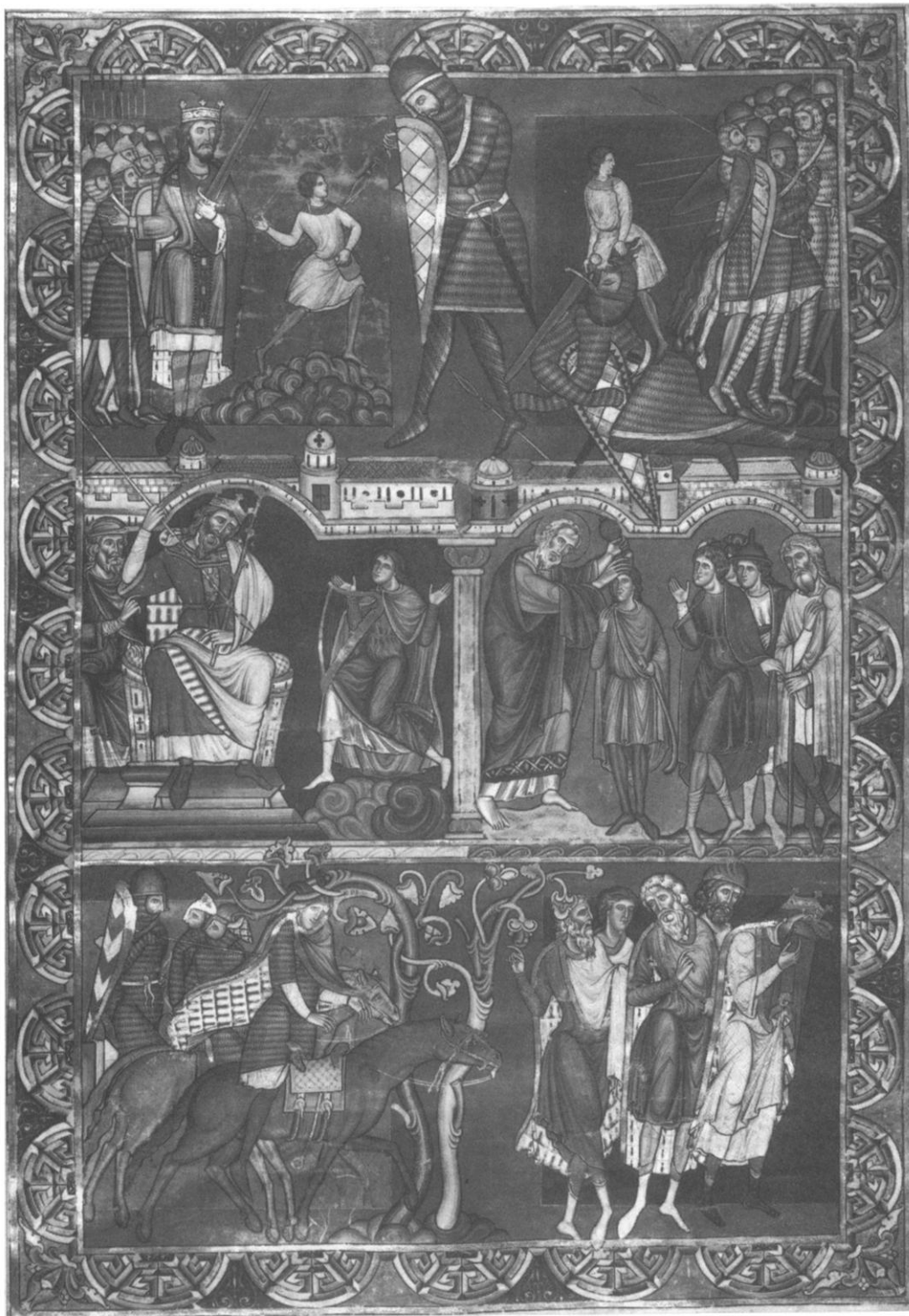
FIGURE 4: Scenes from David's Life, leaf of a Winchester Bible (circa 1180). At the top left, King Saul and his army are "in array" to fight the Philistines, while the young David casts a stone with his slingshot at the enemy's champion, Goliath, too large to be confined by the frame of the picture (1 Kings [1 Sam.] 17:21, 17:49). In the next scene, top right, David takes Goliath's sword and cuts off his head as the Philistines flee