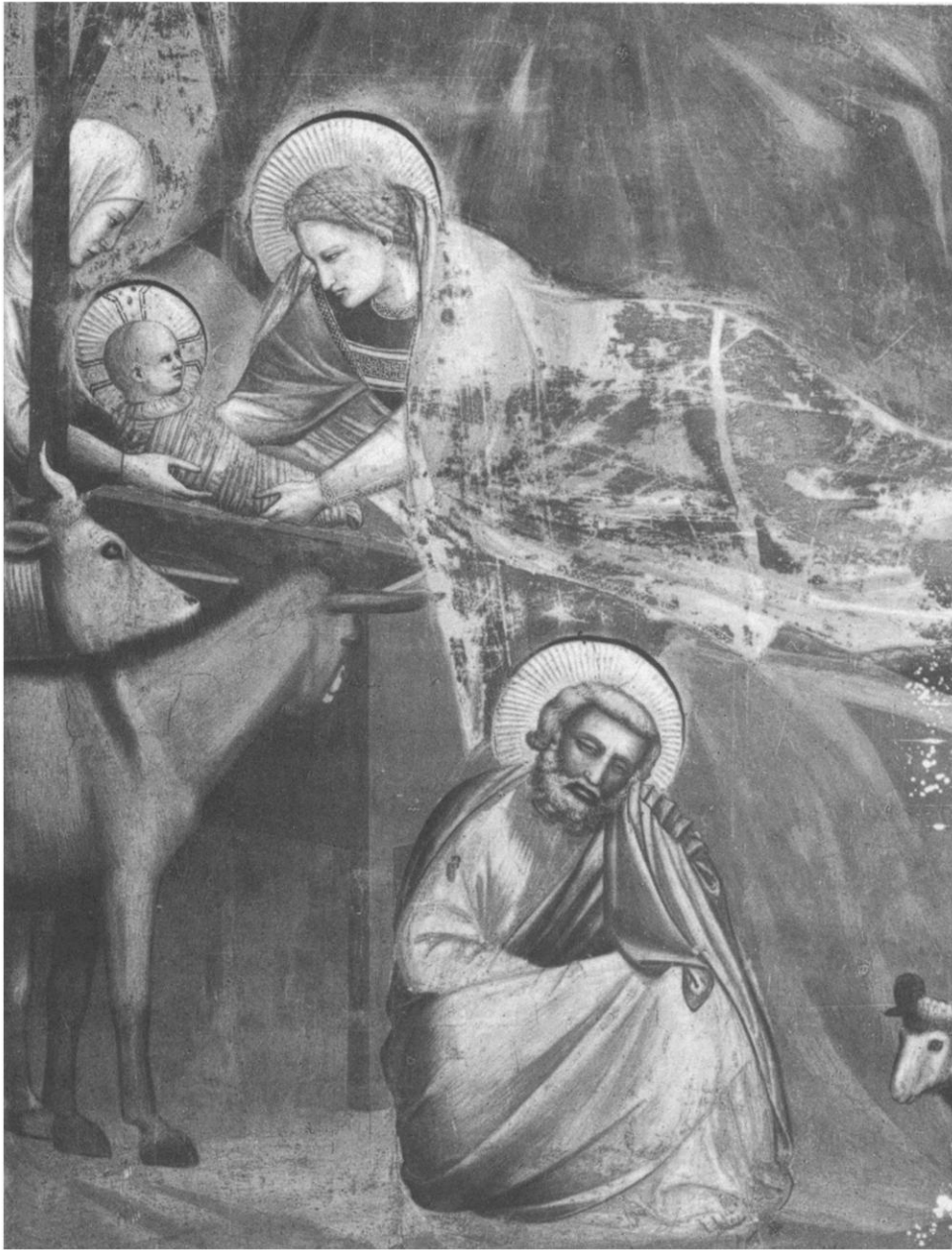
FIGURE 1: Detail from Giotto's Birth of Jesus, Scrovegni Chapel, Padua (1304–1313). In the later Middle Ages, artists such as Giotto humanized the story of Christ's life and death with the addition of homey details, as in this depiction of an exchange of tender glances between mother and child.

the loving family unit emerge. The notion of the affectless family does not contradict the vision of overwrought emotionalism in the Middle Ages, because the love involved in the affective family unit is understood to be tamped down, restrained, and unwavering. In this view, the pre-modern family was at best a